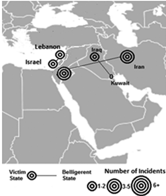
Figure 1. Cyber incidents in the Middle East

Hypothesis 3 could be modified to state that minor powers will operate at the regional level, but major powers operate at the global level. The danger is clearly that these operations will shape international norms and make cyber operations permissible.