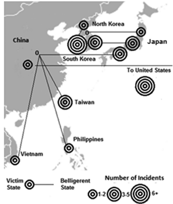
Figure 2. Cyber incidents in East Asia

Although we find strong support for regionalism in this analysis, we cannot overlook the most active cyber dyad in the system that has global implications: the United States and China. The United States and China have been embroiled in 22 cyber incidents